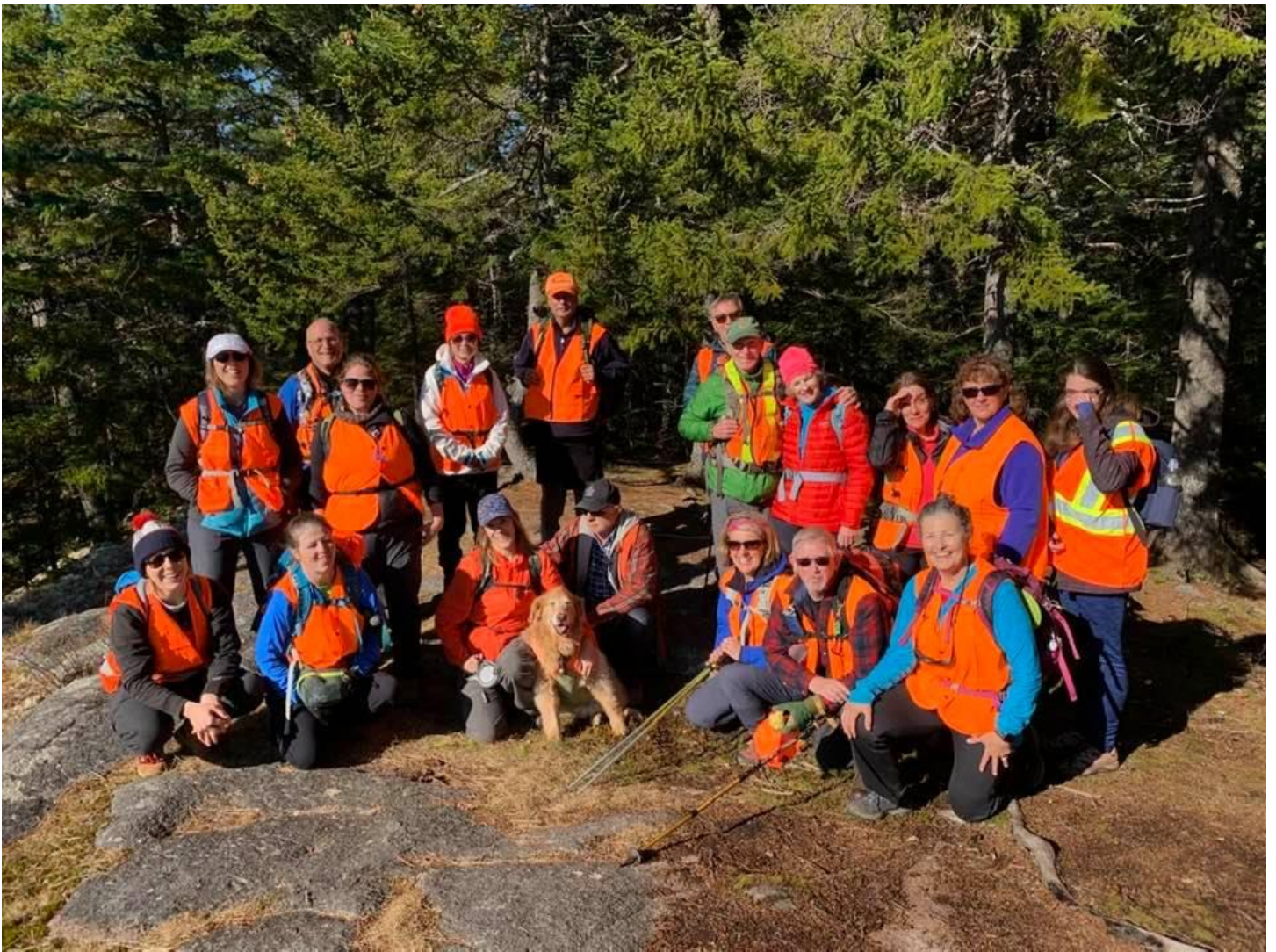
Cochran Lane Cliffs, November 2, 2019