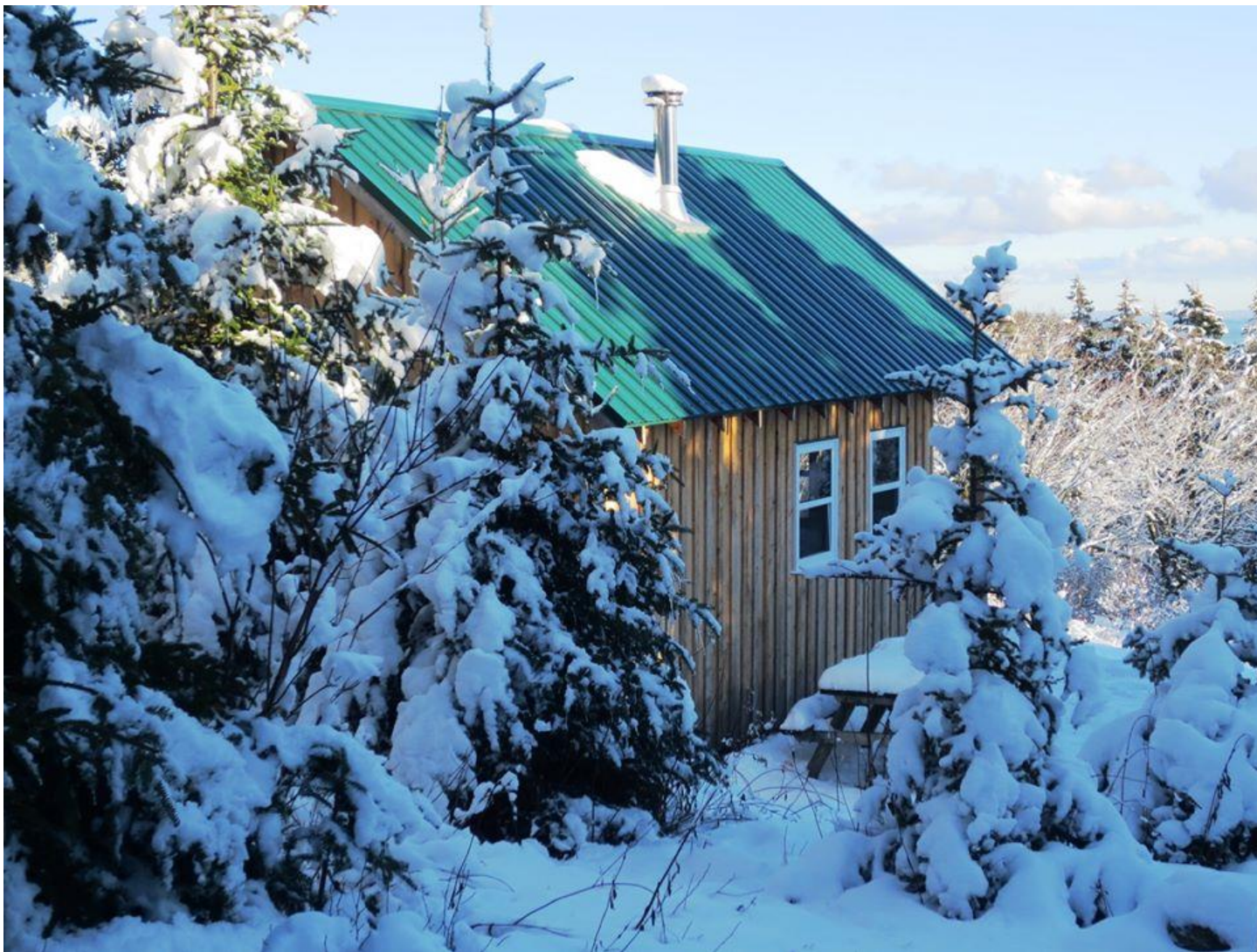
Fundy Park, November 10, 2019