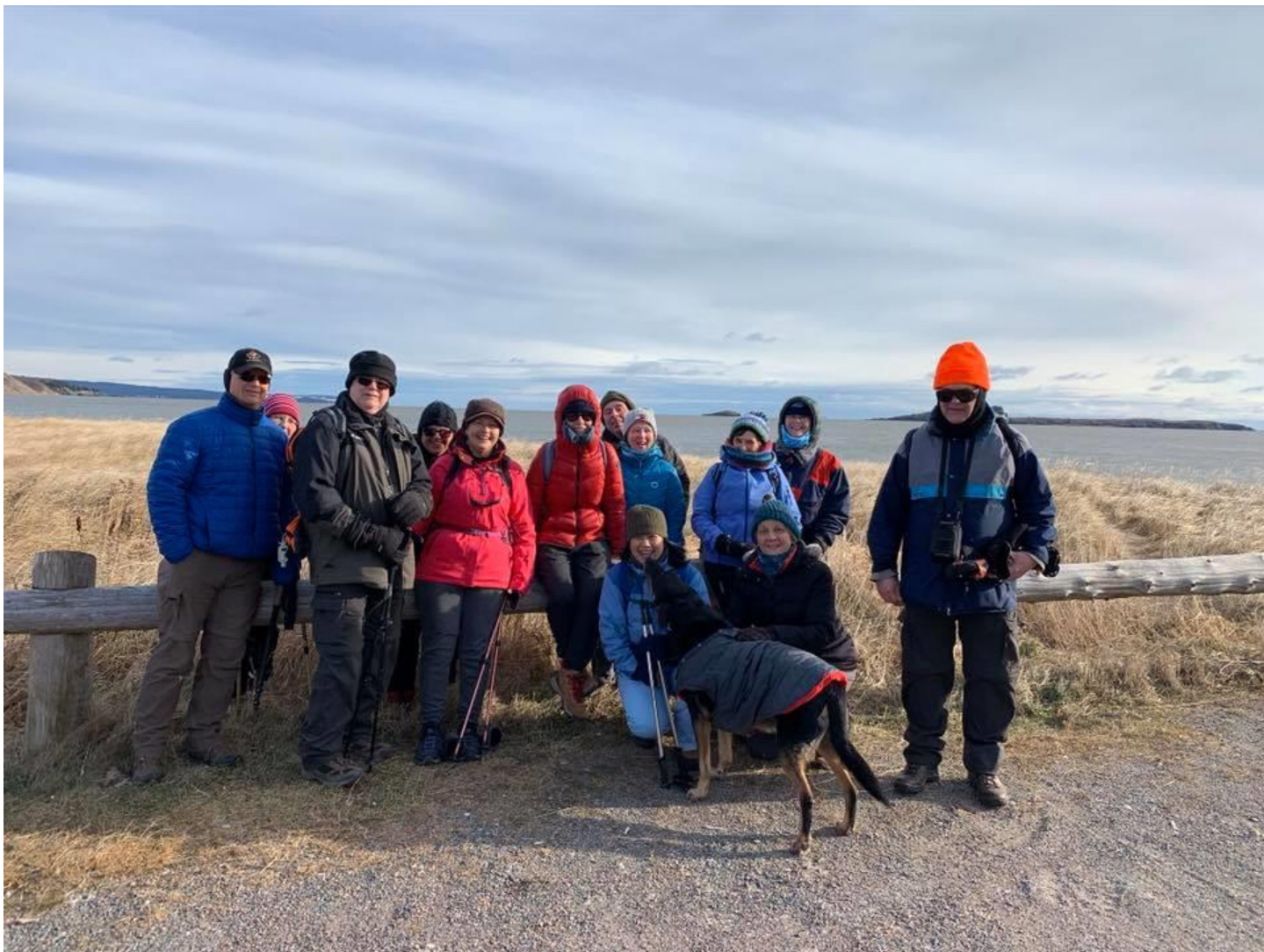
Irving Nature Park, November 30, 2019