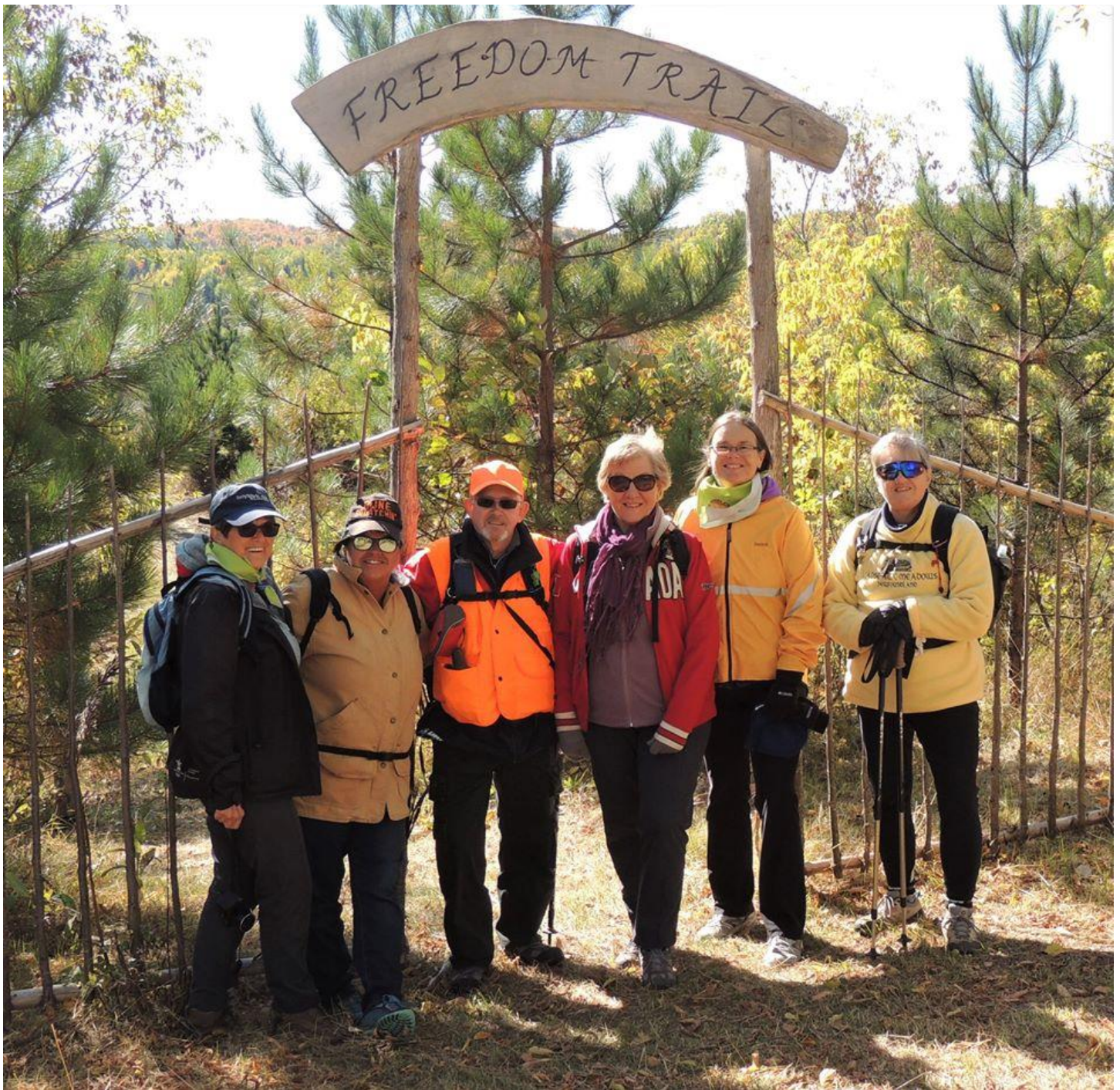
Tomlinson Lake Hike to Freedom, October 5, 2019.