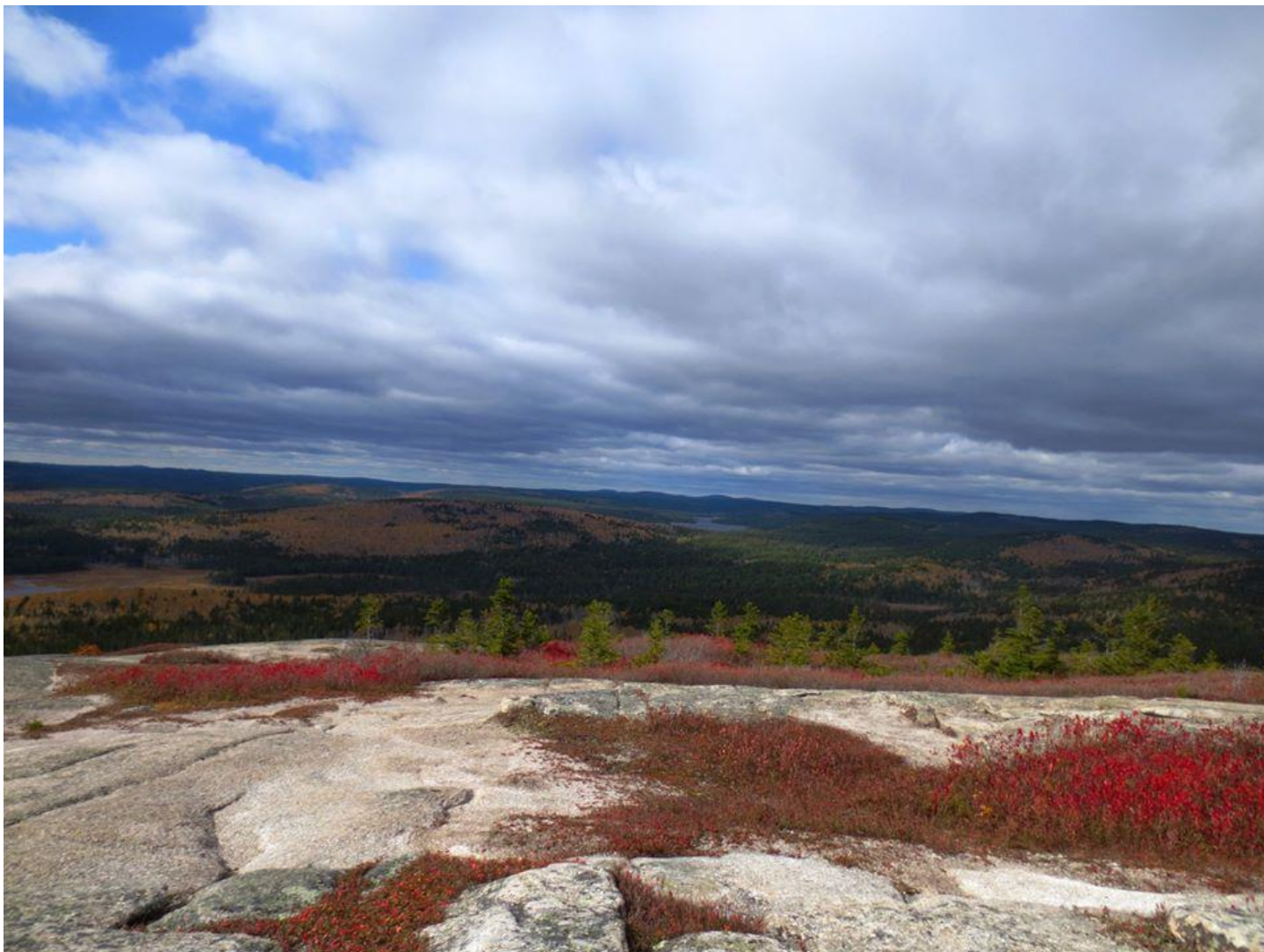
Turtle Mountain, October 19, 2019