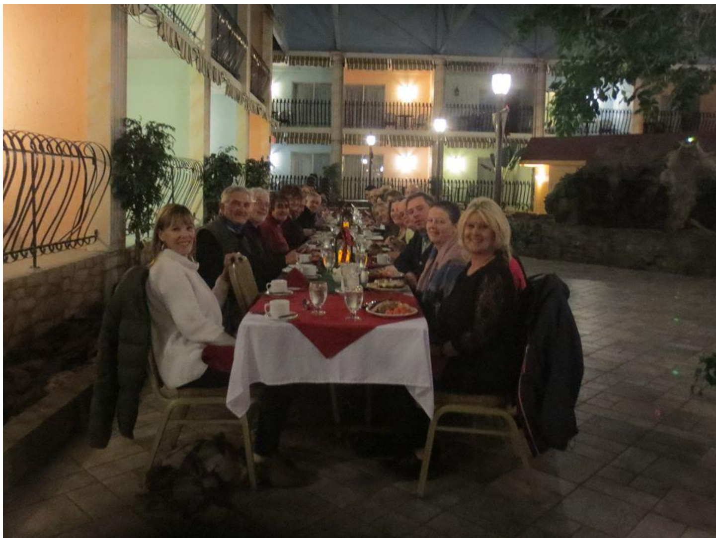
Christmas Dinner, December 7, 2019