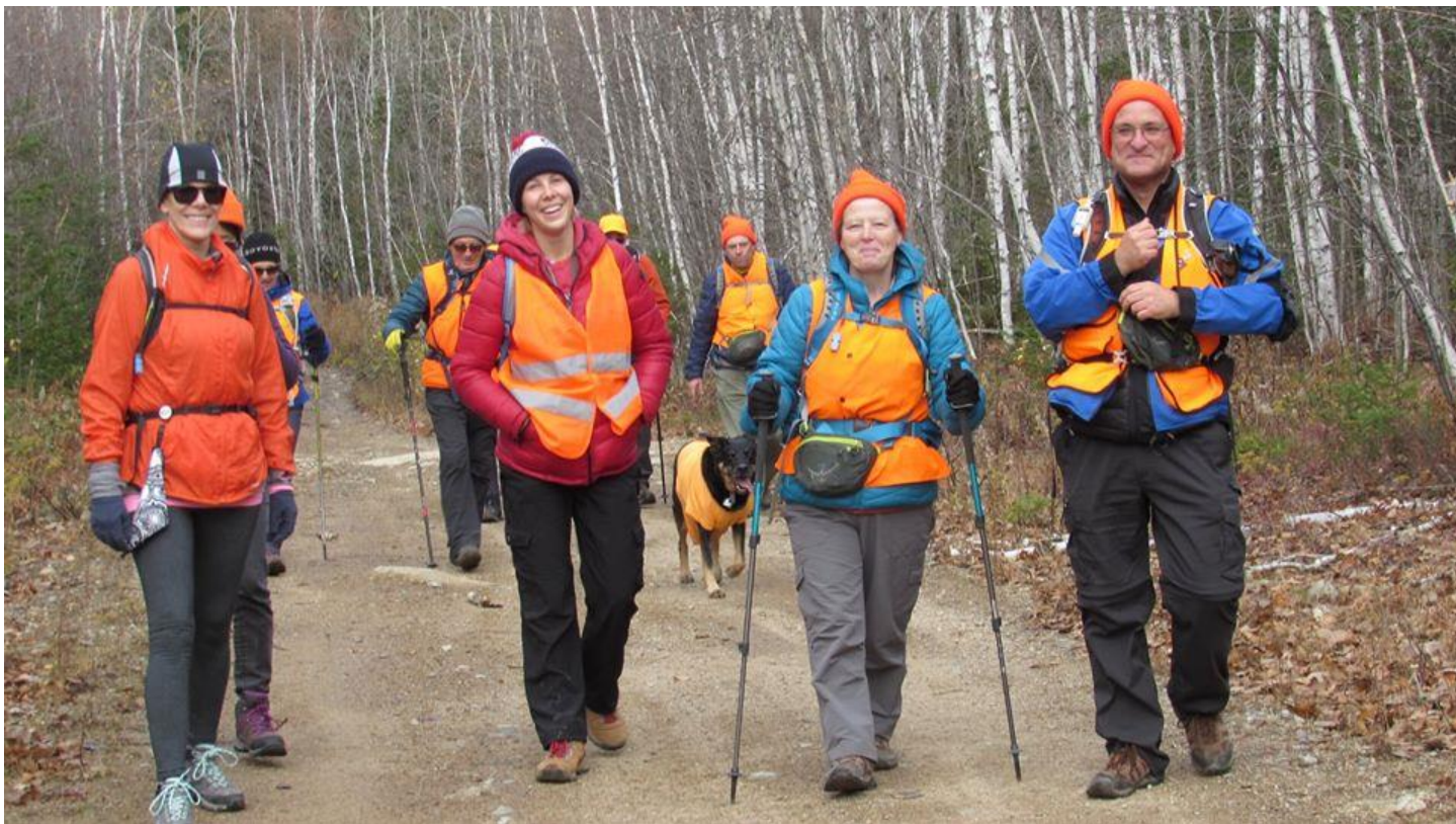
Vultures Bluff, October 27, 2019 by Art McFadden.